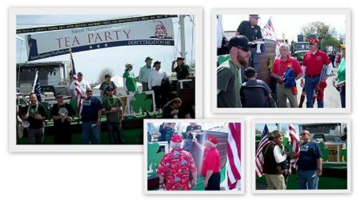
Like our Facebook Page